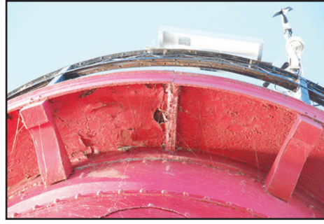
Corrosion has eaten through the balcony and the exterior walls of the lighthouse.

tee is embarking on a campaign to raise $300,000 to not only restore the lighthouse, but maintain it for future generations to enjoy. Your donation will go a long way to preserving the Light!