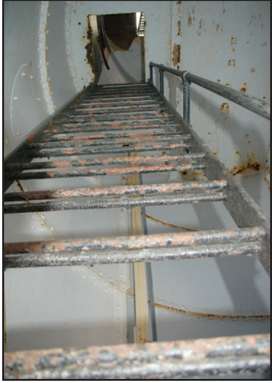
Corrosion covers the stairway and stairwell leading to the lighthouse's second and third stories.

For more than a century, South Haven's popular beacon has lured hundreds of thousands of people and boats to our shores. It has become synonymous with our town's name.