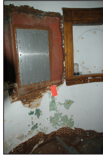
The windows and interior walls of the lighthouse need extensive repair.